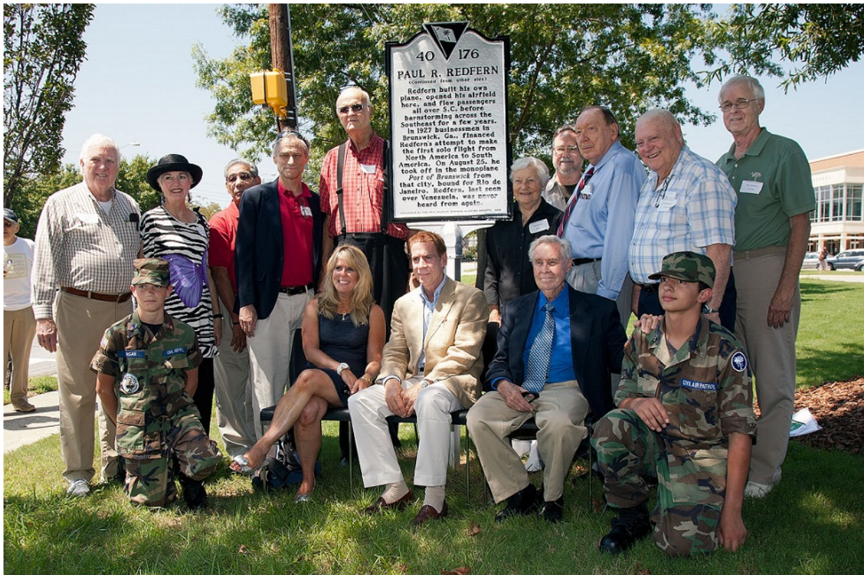
PRRAS 2012 Symposium Committee members and speakers Following the dedication of a new Historical Marker at Dreher High School.

In 2012 for the 80 th anniversary another significant symposium was produced by PRRAS. Here are some pictures and info comments regarding the 2012 PRRAS Symposium and a link to news stories.